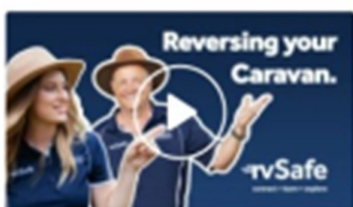
2:47 VIDEO Reversing your Caravan