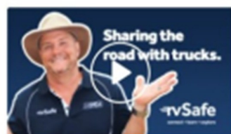
1:35 VIDEO Sharing the Road with Trucks