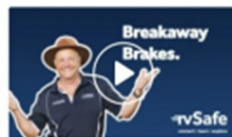
1:39 VIDEO Breakaway Brakes