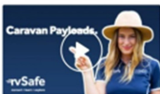
3:15 VIDEO Caravan Payloads

The image below is just a picture — meaning you cannot click on it and go to the video.