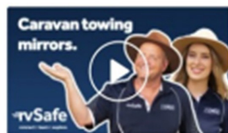
2:00 VIDEO Caravan Towing Mirrors