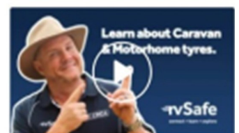
2:12 VIDEO Learn about Caravan and Motorhome Tyres

RV Safe also has a list of RV Road Rules which can be found here:-