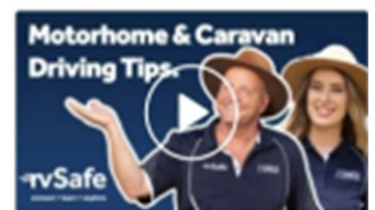
3:19 VIDEO Motorhome and Caravan Driving Tips